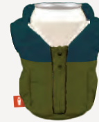
OLIVE GREEN/ SAILOR BLUE DO1214-350