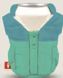
SEAMFOAM/CRATER BLUE DO1197-314