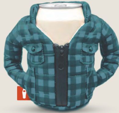
CRATER BLUE DO1195-451