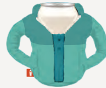
SEAMFOAM/ CRATER BLUE DO1197-314