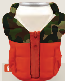
PUFFIN RED/WOODSY CAMO DO1214-650