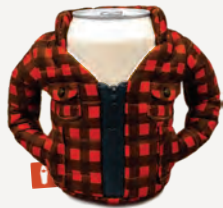
PUFFIN RED DO1195-651