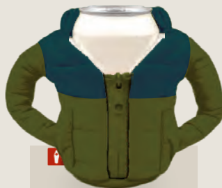
OLIVE GREEN/SAILOR BLUE DO1197-350