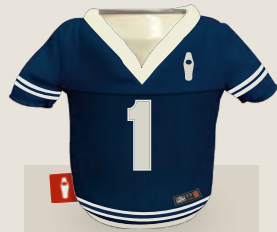
NAVY BLUE/SANDYWHITE DS1240-480