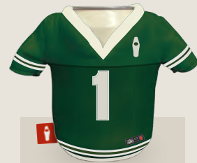
FOREST GREEN/SANDY WHITE DS1240-380