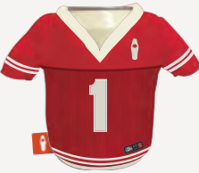
RISKY RED/ SANDY WHITE DS1240-660