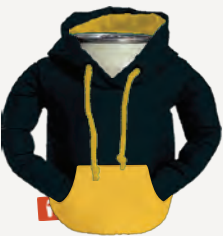
BLACK/ CANARY DO1229-017