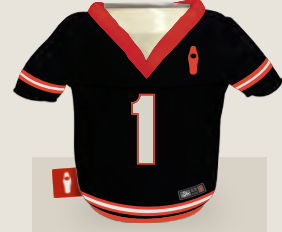
BLACK/RISKY RED DS1240-016