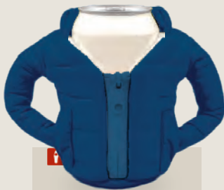
VARSITY BLUE DO1197-450