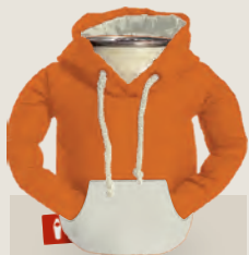
TANGERINE/SANDY WHITE DO1229-850