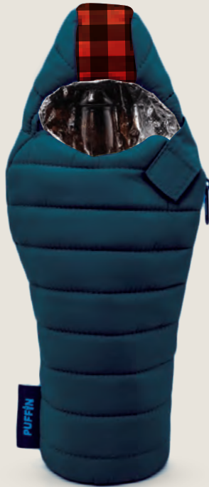
SAILOR BLUE/PUFFIN RED DO1207-470