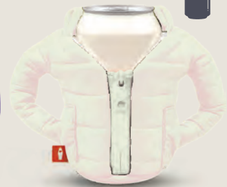
SANDY WHITE DO1197-120