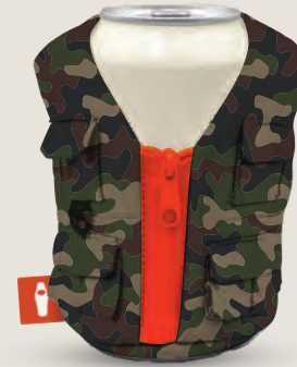
WOODSY CAMO DO1193-901