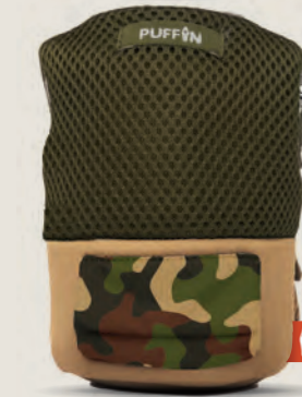
TACO TAN/OLIVE GREEN DO1193-213