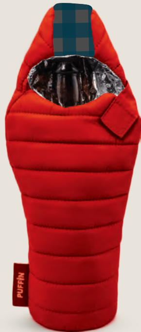
PUFFIN RED/CRATER BLUE DO1207-650