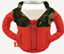
PUFFIN RED/ WOODSY CAMO DO1197-850