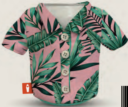
ISLAND TIME DG1980-961

Tropic like it's hot. Make sure to wear your Aloha shirt this Friday to the office! Whether you're at the beach on your vacation, or just in your mind, The Aloha is the best way to show you're chill.