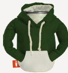
FOREST GREEN/ SANDY WHITE DO1229-380