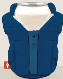
VARSITY BLUE DO1214-450