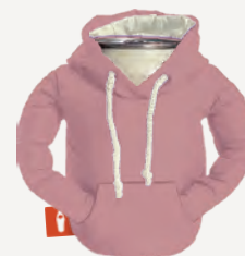
DUSTY ROSE/ SANDY WHITE DO1229-610