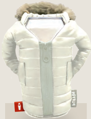
SANDY WHITE DO1227-120