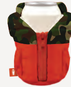
PUFFIN RED/ WOODSY CAMO DO1214-650