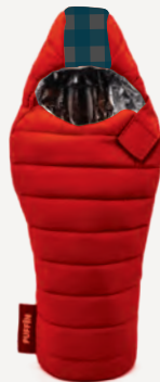
PUFFIN RED/CRATER BLUE DO1207-650