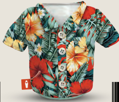
WEEKEND VIBES DG1981-965