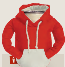
RISKY RED/SANDY WHITE DO1229-660