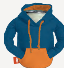
ROYAL BLUE/ TANGERINE DO1229-445