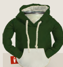
FOREST GREEN/SANDY WHITE DO1229-380