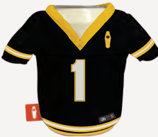
BLACK/ CANARY DS1240-017