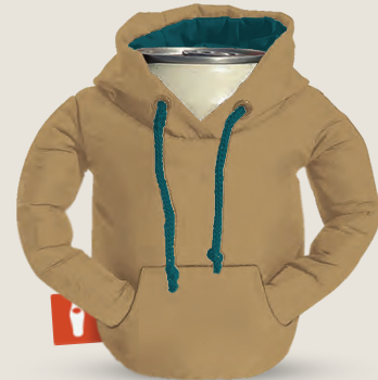
TACO TAN/ SAILOR BLUE DO1229-210