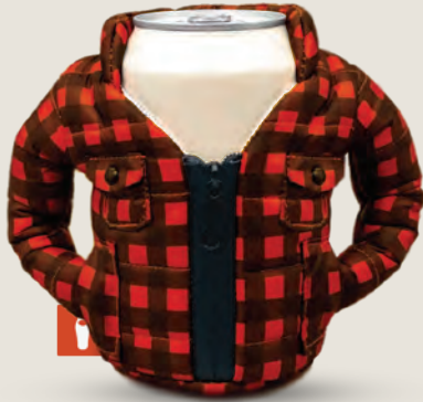
PUFFIN RED DO1195-651