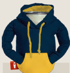
NAVY BLUE/CANARY DO1229-487