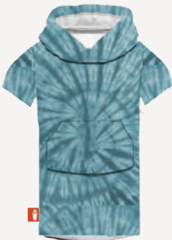
RIPPLE/CRATER BLUE DO1155-906