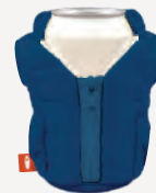
VARSIY BLUE DO1214-450