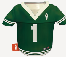
FOREST GREEN/ SANDY WHITE DS1240-380