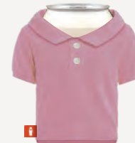
DUSTY ROSE DG1967-315