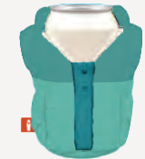
SEAMFOAM/ CRATER BLUE DO1197-314