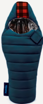
SAILOR BLUE/PUFFIN RED DO1207-470