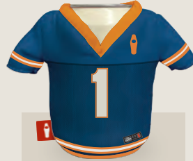
ROYAL BLUE/TANGERINE DS1240-445