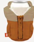
HONEY BROWN/ TACO TAN DO1214-250