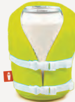
KEYLIME PIE DO1202-310