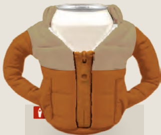
HONEY BROWN/TACO TAN DO1197-250