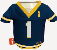
NAVY BLUE/ CANARY DS1240-487