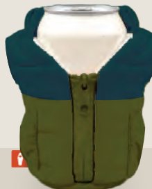
OLIVE GREEN/SAILOR BLUE DO1214-350