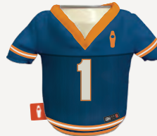
ROYAL BLUE/ TANGERINE DS1240-445