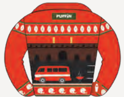
THE GAME DAY DO1354-904