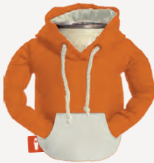
TANGERINE/ SANDY WHITE DO1229-850