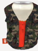
WOODSY CAMO DO1193-901