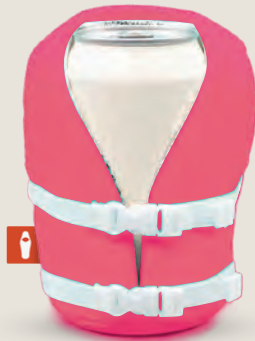
PARTY PINK DO1202-620