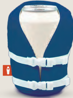
VARSITY BLUE DO1202-450