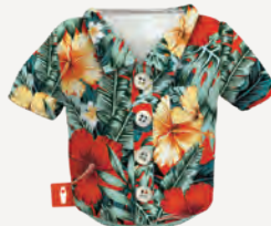
WEEKEND VIBES DG1981-965