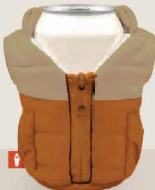
HONEY BROWN/TACO TAN DO1214-250