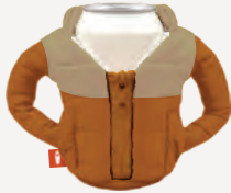
HONEY BROWN/ TACO TAN DO1197-250