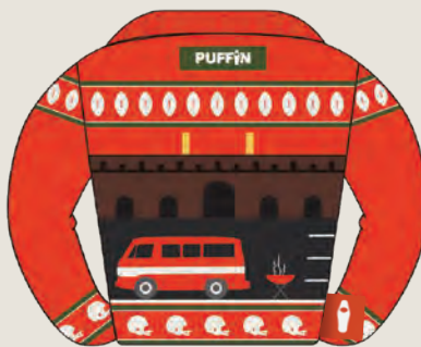
THE GAME DAY DO1354-904