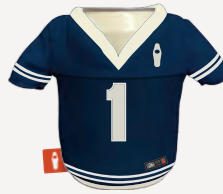
NAVY BLUE/ SANDY WHITE DS1240-480