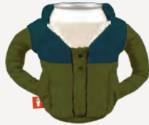
OLIVE GREEN/ SAILOR BLUE DO1197-350