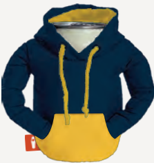
NAVY BLUE/ CANARY DO1229-487