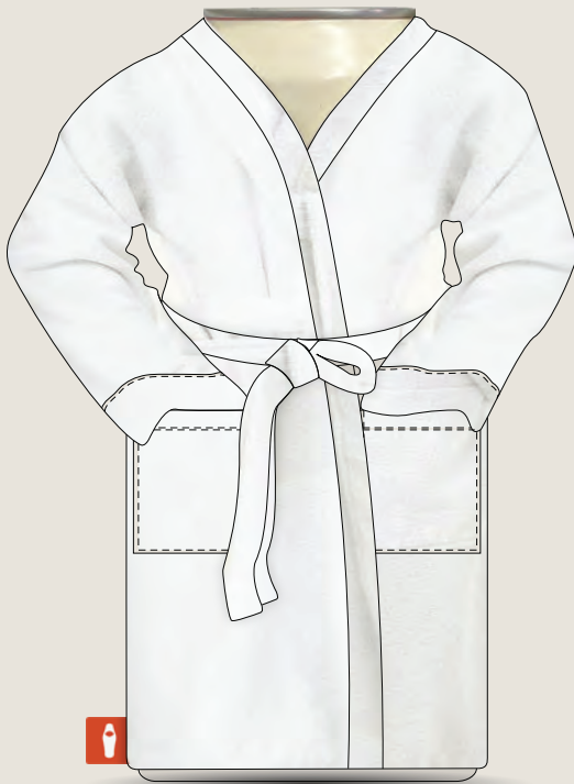
SANDY WHITE DG1953-120