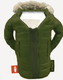
OLIVE GREEN DO1227-350