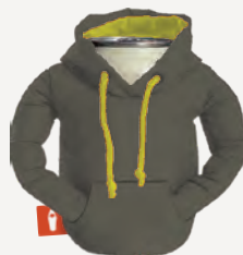
PEWTER/KEYLIME PIE DO1229-050