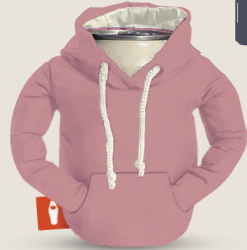
DUSTY ROSE/ SANDY WHITE DO1229-610