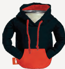
BLACK/ RISKY RED DO1229-016