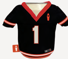
BLACK/ RISKY RED DS1240-016