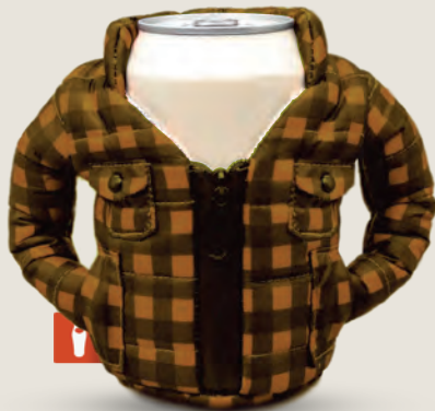
TACO TAN DO1195-251