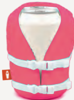
PARTY PINK DO1202-620