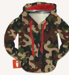
WOODSY CAMO/ PUFFIN RED DO1229-901