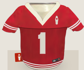
RISKY RED/SANDY WHITE DS1240-660