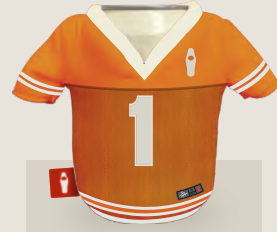
TANGERINE/SANDY WHITE DS1240-850