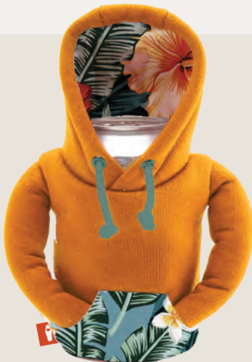
HONEY BROWN/ ISLAND TIME DO1229-820

Keep your drink chill and comfy in The Hoodie, complete with all the nostalgic touches of your favorite 90s sweatshirt.