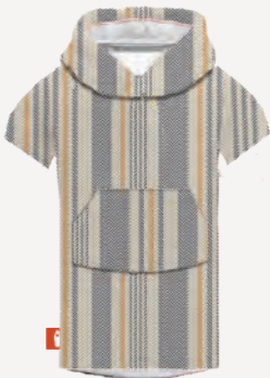
BAJA/HONEY BROWN DO1155-907