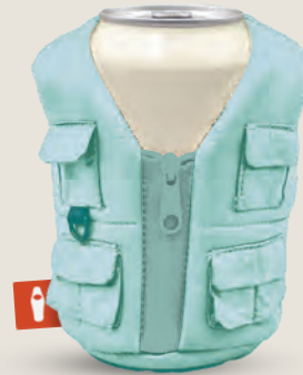
POWDER BLUE DO1193-410