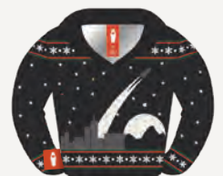
THE TAKE OFF DO1354-905