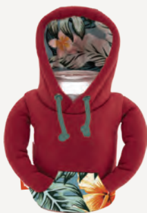
BRICK RED/ ISLAND TIME DO1229-670