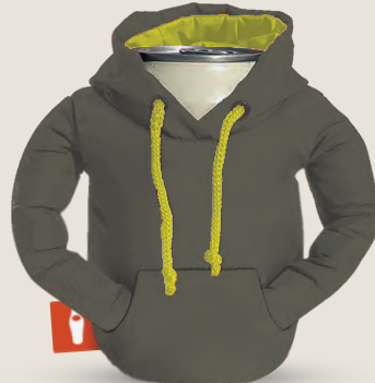
PEWTER/KEYLIME PIE DO1229-050