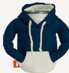
NAVY BLUE/ SANDY WHITE DO1229-480