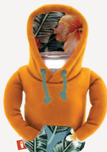
HONEY BROWN/ ISLAND TIME DO1229-820