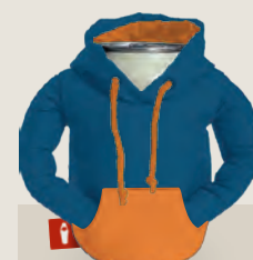
ROYAL BLUE/TANGERINE DO1229-445