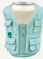
POWDER BLUE DO1193-410