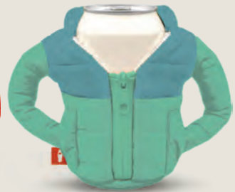
SEAMFOAM/CRATER BLUE DO1197-314