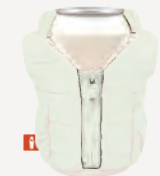
SANDY WHITE DO1197-120