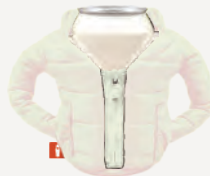
SANDY WHITE DO1197-120