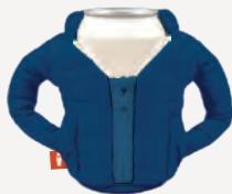
VARSIY BLUE DO1197-450