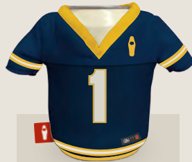
NAVY BLUE/CANARY DS1240-487