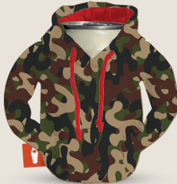
WOODSY CAMO/ PUFFIN RED DO1229-901