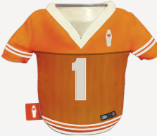
TANGERINE/ SANDY WHITE DS1240-850