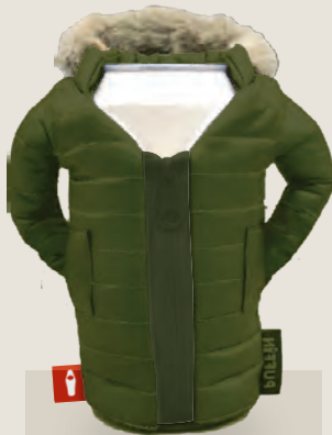
OLIVE GREEN DO1227-350