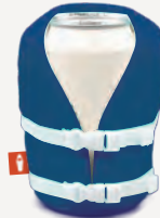
VARSITY BLUE DO1202-450