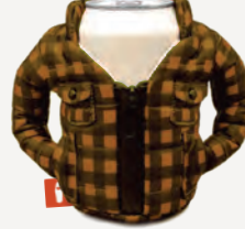
TACO TAN DO1195-251