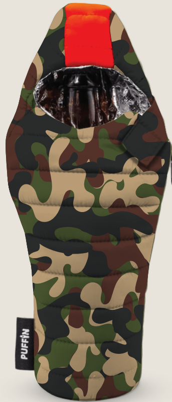
WOODSY CAMO/PUFFIN RED DO1212-901