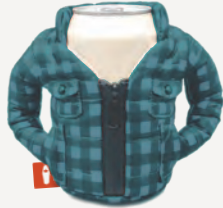
CRATER BLUE DO1195-451