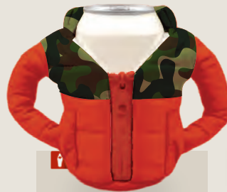
PUFFIN RED/WOODSY CAMO DO1197-850