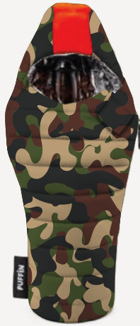
WOODSY CAMO/PUFFIN RED DO1212-901