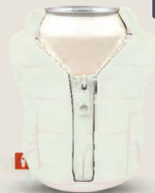
SANDY WHITE DO1197-120