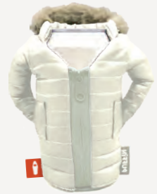
SANDY WHITE DO1227-120