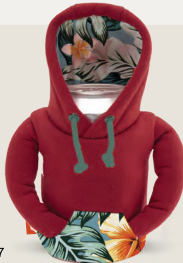
BRICK RED/ISLAND TIME DO1229-670