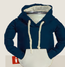
NAVY BLUE/SANDYWHITE DO1229-480