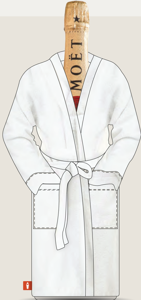
SANDY WHITE DG1955-120