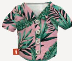
ISLAND TIME DG1980-961