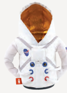
THE SPACE SUIT DJ1361-120