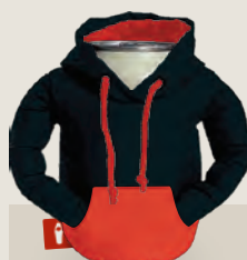
BLACK/RISKY RED DO1229-016