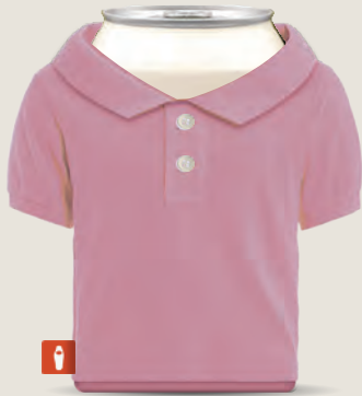
DUSTY ROSE DG1967-315

It's a beautiful day on the golf course. The perfect shirt for hitting the links, the trading floor, or your VC firm's casual Friday lunch mixer.