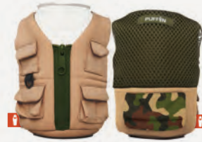
TACO TAN/OLIVE GREEN DO1193-213