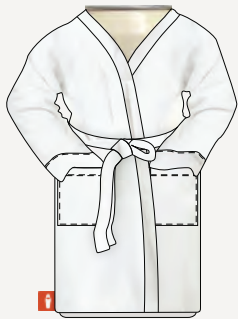
SANDY WHITE DG1953-120