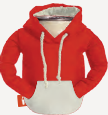
RISKY RED/ SANDY WHITE DO1229-660