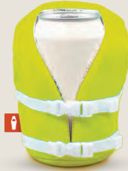
KEYLIME PIE DO1202-310