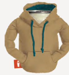
TACO TAN/ SAILOR BLUE DO1229-210